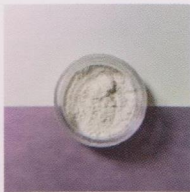
InterFine Red 2012